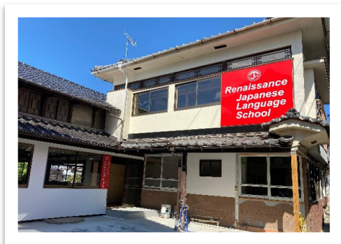
Overview of the school

The school building was remodeled from an old private house, and has a quaint exterior and traditional designs. The school is a two-story wooden structure: the first-floor housing the Classroom No. 1 (capacity 20), library, infirmary, teaching room, teacher's room, office, and restrooms; the second-floor housing the Classroom No. 2 (capacity 10). The room is bright and open with many windows.